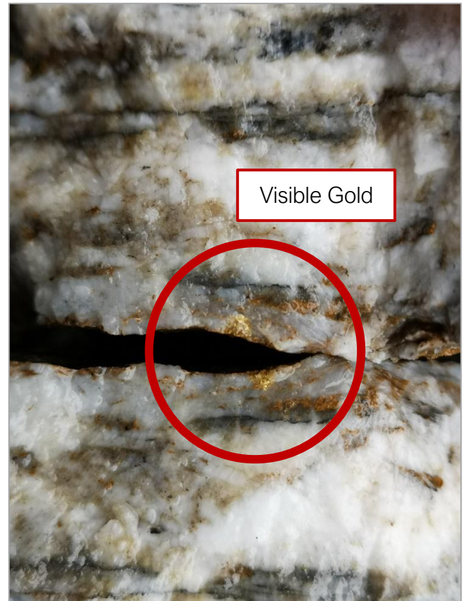
Visible Gold from Little Joanna, Nov. 2020